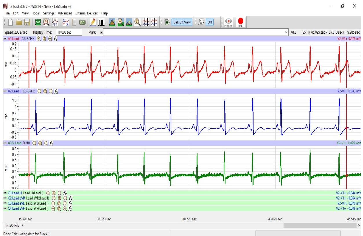
Figure HH-10-B2: Electrocardiograms recorded from Lead I, Lead II, and Lead V1 positions at the same time. The other leads have been minimized.